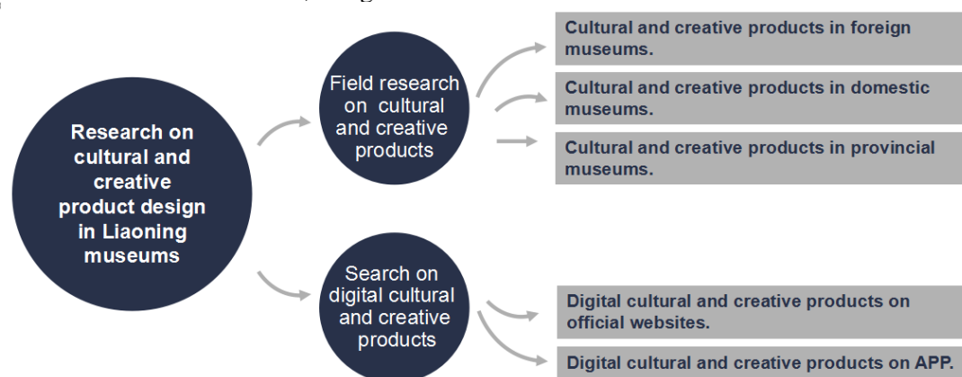
Figure 1. Classification of cultural and creative products in Liaoning Museums